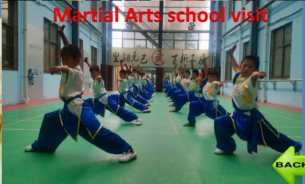
Martial Arts school visit