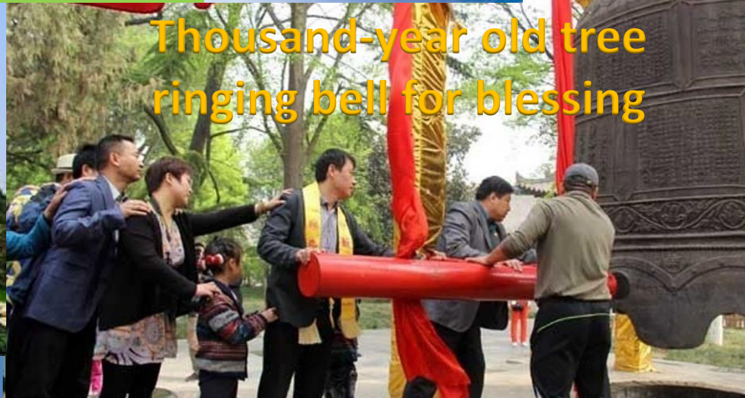
Thousand-year old tree ringing bell for blessing