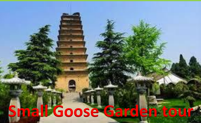
Small Goose Garden tour