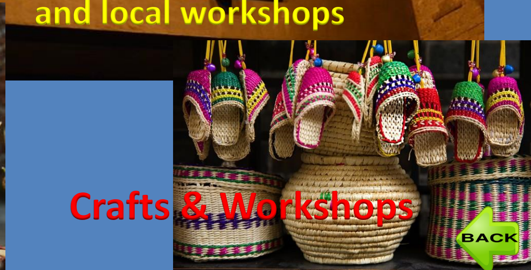
Crafts & Workshops