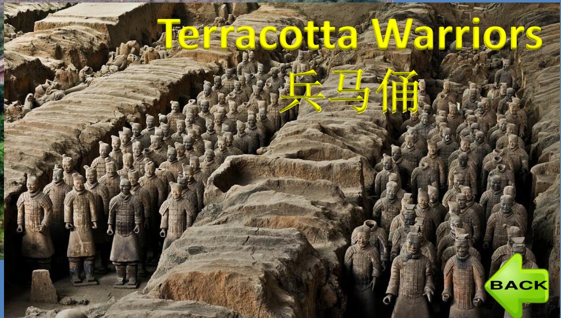
Terracotta Warriors 兵马俑