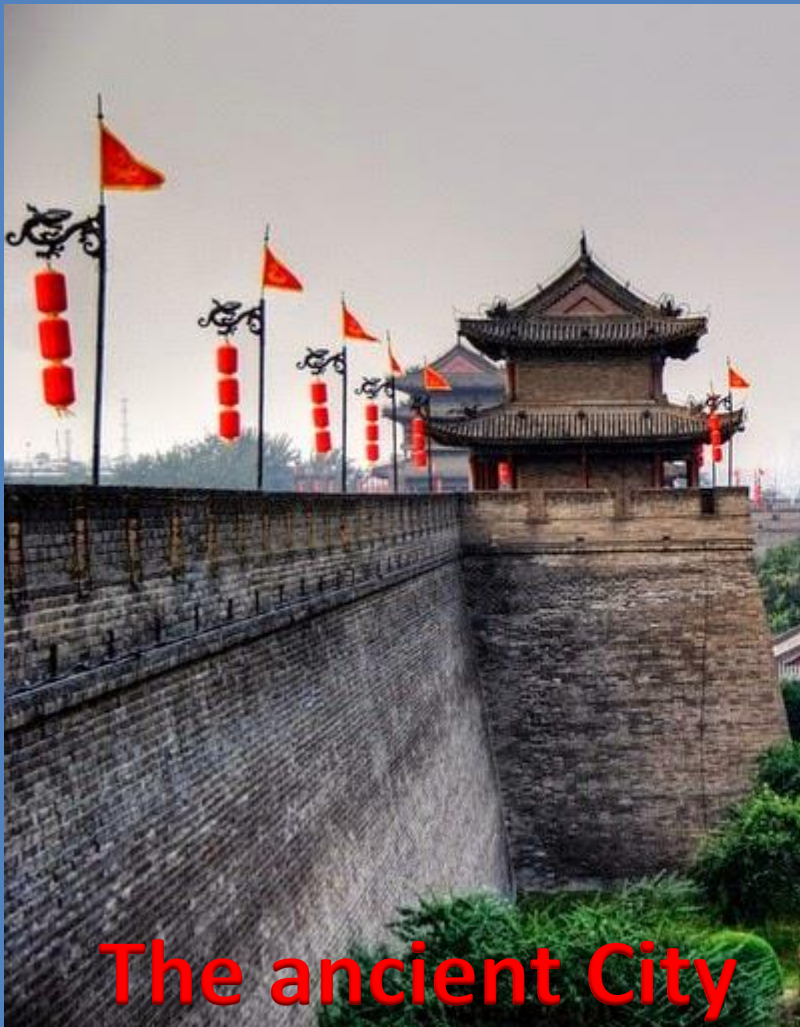
The ancient City Walls 西安古城