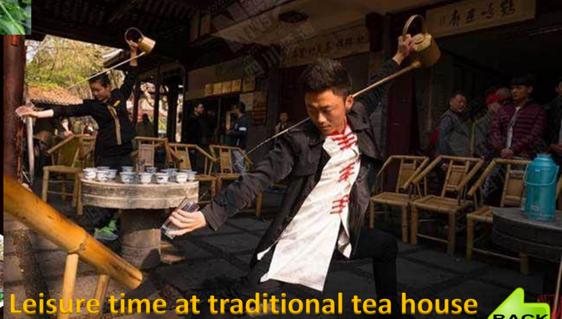
Leisure time at traditional tea house