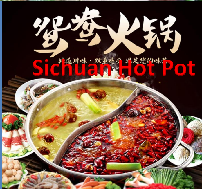
鸳鸯火锅 地道川味·双重感受·满足您的味蕾 Sichuan Hot Pot